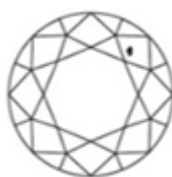
VVS1 / VVS2 Very Very Slightly Included