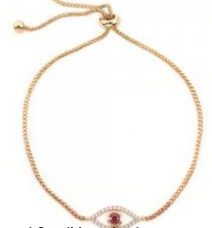
General Conditions Apply

Bracelet in 18k rose gold set with 1 brilliant-cut ruby and 28 brilliant-cut diamonds. Weight: 4.46 gm.