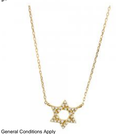
General Conditions Apply Visit: www.damiancolombo.com

Necklace in 18k yellow gold set with 30 brillant-cut diamonds.Weight: 1