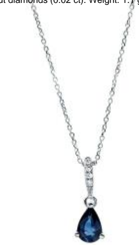
General Conditions Apply Visit: www.damiancolombo.com

Necklace in 18k white gold set with 1 pearl-cut sapphire (0.39 ct) and 4 brilliant-cut diamonds (0.02 ct). Weight: 1.1 grams.