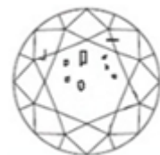
I1 / I2 / I3 Included