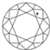
VVS1 / VVS2 Very Very Slightly Included