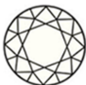
G-J Near Colorless