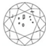
I1 / I2 / I3 Included