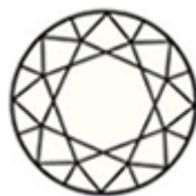
G-J Near Colorless