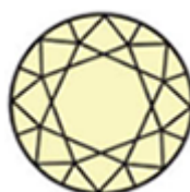
N-R Very light