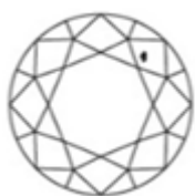
VVS1 / VVS2 Very Very Slightly Included