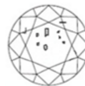
I1 / I2 / I3 Included