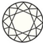
G-J Near Colorless