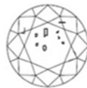
I1 / I2 / I3 Included