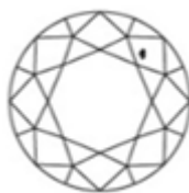
VVS1 / VVS2 Very Very Slightly Included